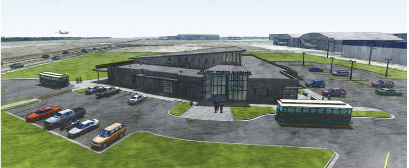
Flight Works rendering produced by Mott Macdonald.