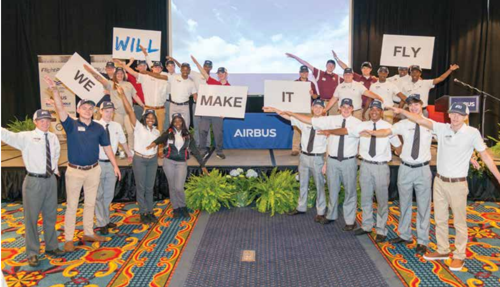
The first class of FlightPath9 students.

are intended to train participants for the aircraft production workforce from within the Mobile community.