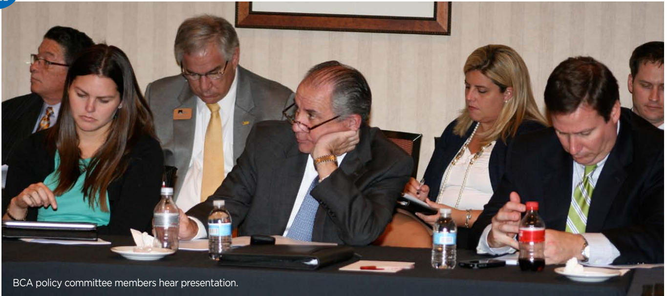
BCA policy committee members hear presentation.